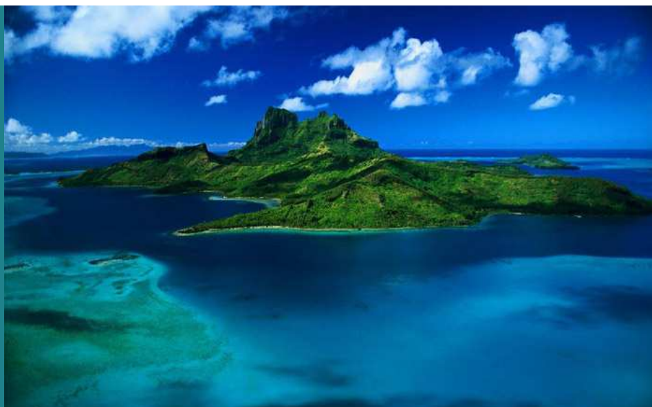
One of the remote islands of Fiji that are waiting for you!

Visit the above FHCC vessel pages online to learn more about each vessel and crew.