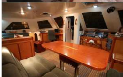
Vessels and accommodations!